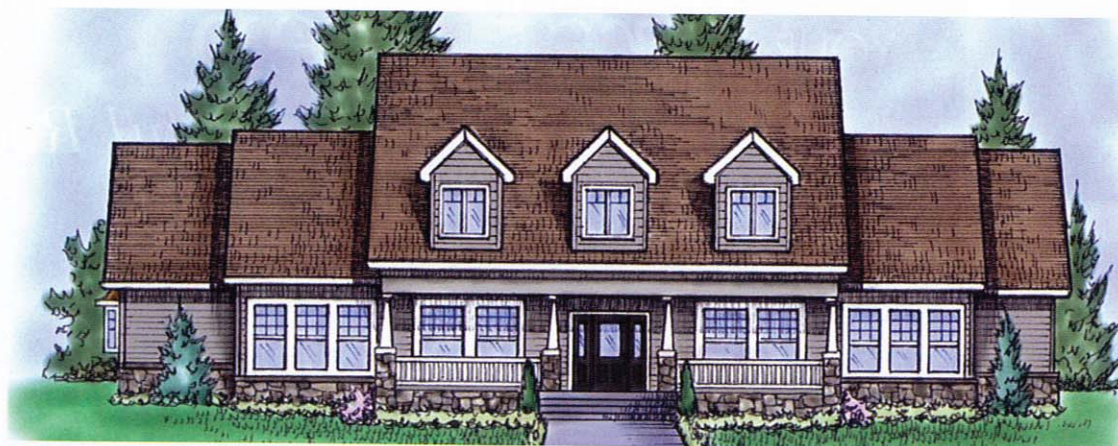
11392 Zier Road • Yakima, WA

The Lord has blessed New Creation Construction, LLC with another great year. We would like to say thanks to all of our staff and to the homeowners for allowing us to feature their home. This is one Category "B" home that you won't want to miss.